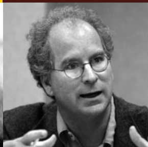
Brewster Kahle Internet Archive